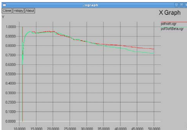
Fig.2:Packet delivery ratio graph using alpha and beta method