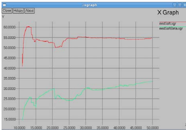
Fig. 1:End-to-end delay graph using alpha and beta method

In simulation we are using network simulator program (version 2.34). In this we have find the average results of throughput, end-to-end delay and packet delivery ratio. As the previous work on handover using technique was alpha and it was simply based on the probability factor. But in this efficient method to carry a soft handover firstly it will maintain a diversity set then it will calculate the various factor like distance, congestion and signal on each base station. Then by finding the appropriate values depends on the factors it will give the handover to the target base station. As we are using mobile WiMax it will give good coverage as well as speed. So it will give more efficient results as compare to the previous research in term of throughput, end-to-end-delay and packet delivery ratio.